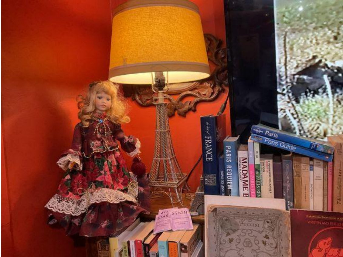
Paris in springtime exhales golden light, The Eiffel Tower glows at the edge of the night -ChatGBT